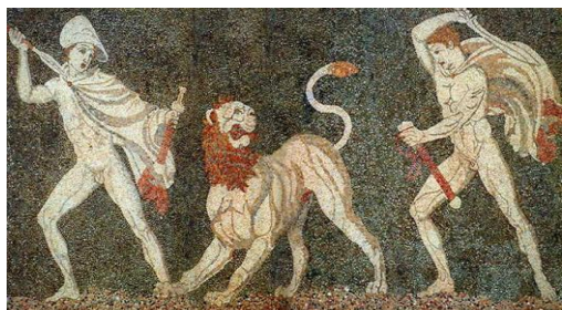
Mosaic from Pella

can see the waterfalls, the cave with stalactites and the living reptiles' museum. Lunch in Edessa.