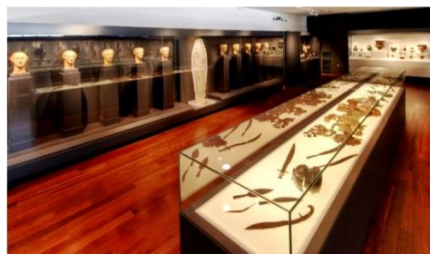
Archaeological museum of Pella