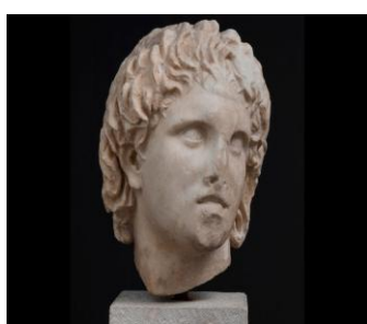
Head of Alexander the Great